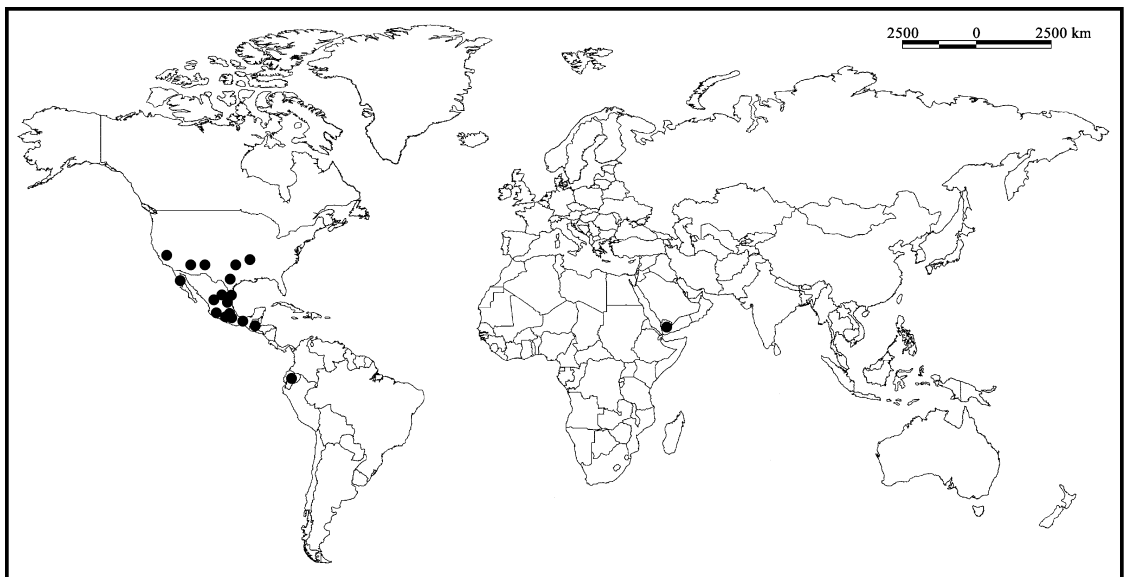
FIGURE 1. Present known distribution of Didymodon revolutus .

Plants to 2 mm high, growing in loose turfs, olive-green or brown. Stems erect, simple, hyalodermis absent, sclerodermis absent or scarcely differentiated, central strand differentiated. Axillary hairs of 3–7 cells, with 1–2 brown basal cells and